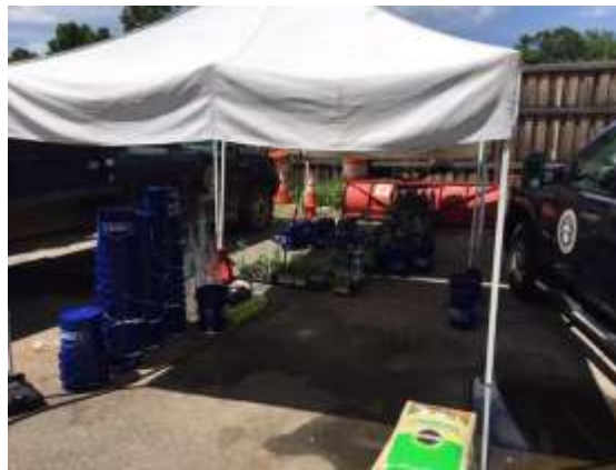
Tents erected with a sprinkler system - behind the Public Works Building